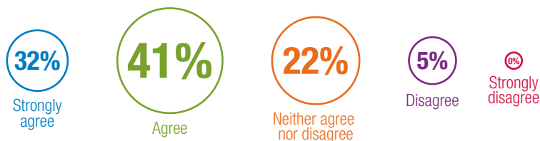
Figure 3-7 Creation of ‘place’ is becoming the most important factor for real estate performance